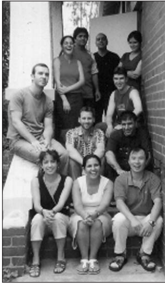
Participants in "Equal Wings" gender equality workshop in Melbourne

Men and boys have a critical role to play in the establishment of gender equality, and this role requires far greater attention and action.