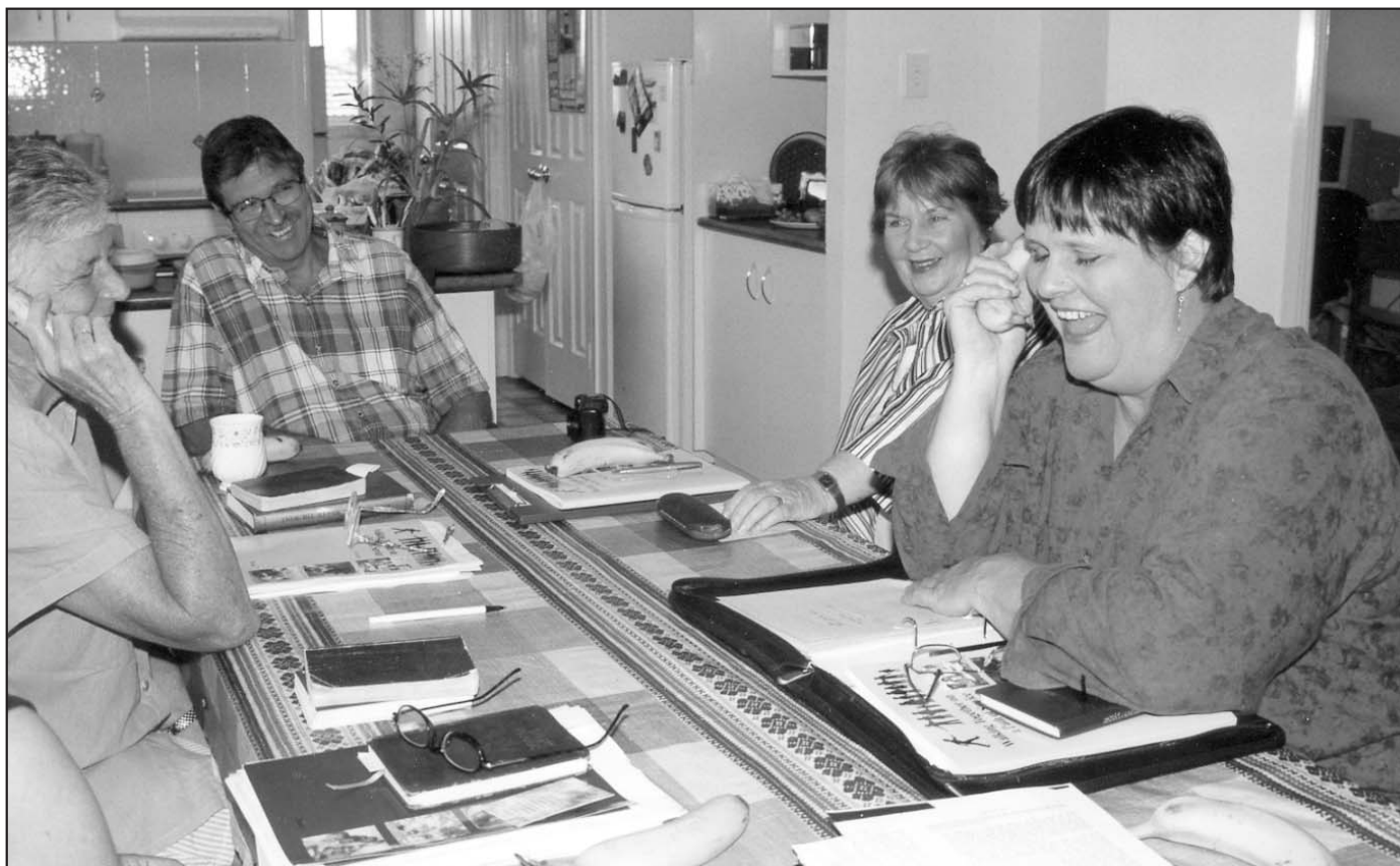
Study circle participants at a rare face-to-face meeting demonstrate their telephone technique.