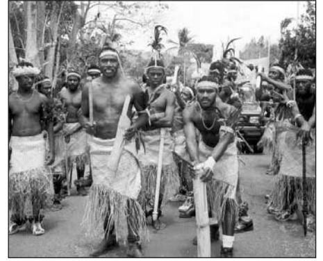
Traditional dancers from Vanuatu's Tongoa island starting the jubilee parade in Port Vila

Funding has recently been provided to a character development project for school children in Fiji; scholarships to enable students from remote and disadvantaged areas of Papua New Guinea to attend a primary teacher training college; and construction of new school buildings for the Ocean of Light International School in Tonga and the Rowhani School in Vanuatu.