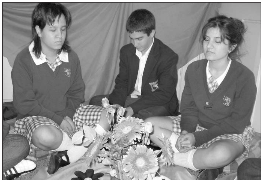
Students meditate at a Soul Food lunchtime gathering

Based on the experience gained at Balwyn High, a similar initiative is now taking place at nearby Viewbank Secondary College.