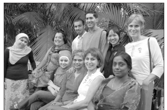
Students and staff representing Indigenous, Bahá'í, Buddhist, Christian, Hindu, Islamic, Jewish and Sikh faiths came together for the launch of the inaugural Inter-faith Calendar for the University of Western Australia in March.

The full text of the statement can be found online at www.bic-un.bahai.org