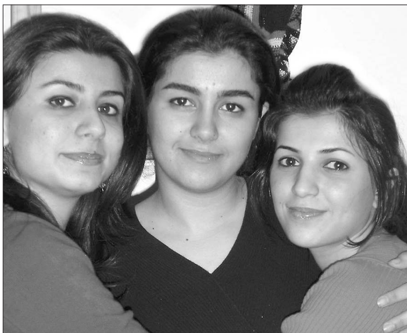
Three of the young Bahá'ís arrested in Shiraz on 19 May

Classified as "unprotected infidels", Bahá'ís have no legal recourse for the denial of their rights.