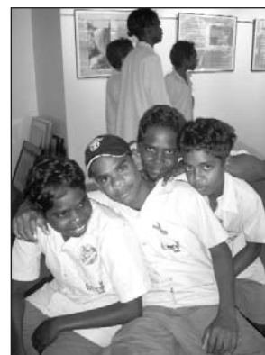
Darwin school students visit the Bahá'í Expo